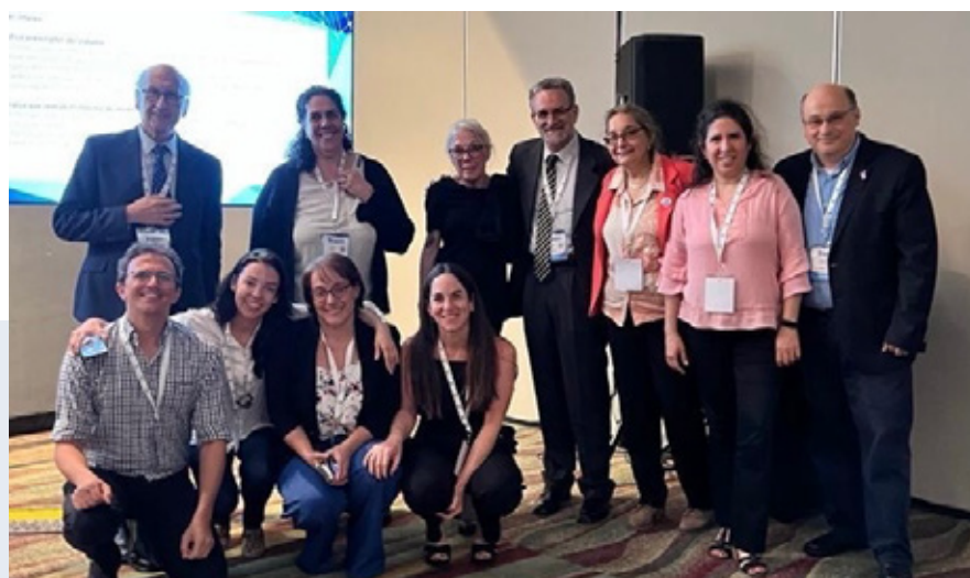
Speakers of the sessions on Interventional Radioguided Surgery.