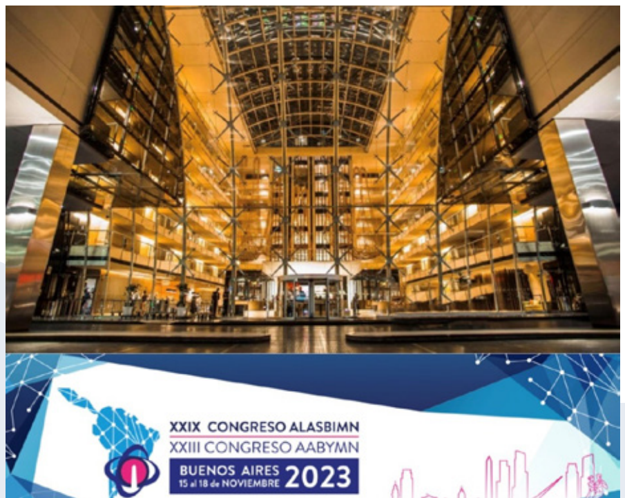
Congress venue of ALASBIMN 2023 in the Convention Center of Hotel Hilton of Buenos Aires.

ALASBIMN was founded in 1964 and its first congress took place in Lima, Peru, in 1966. The last congresses of ALASBIMN have been effectuated in Santiago of Chile (2017), Lima (2019) and this year in Buenos Aires. The next congress will be held in 2025 in Cancún, México. ♦